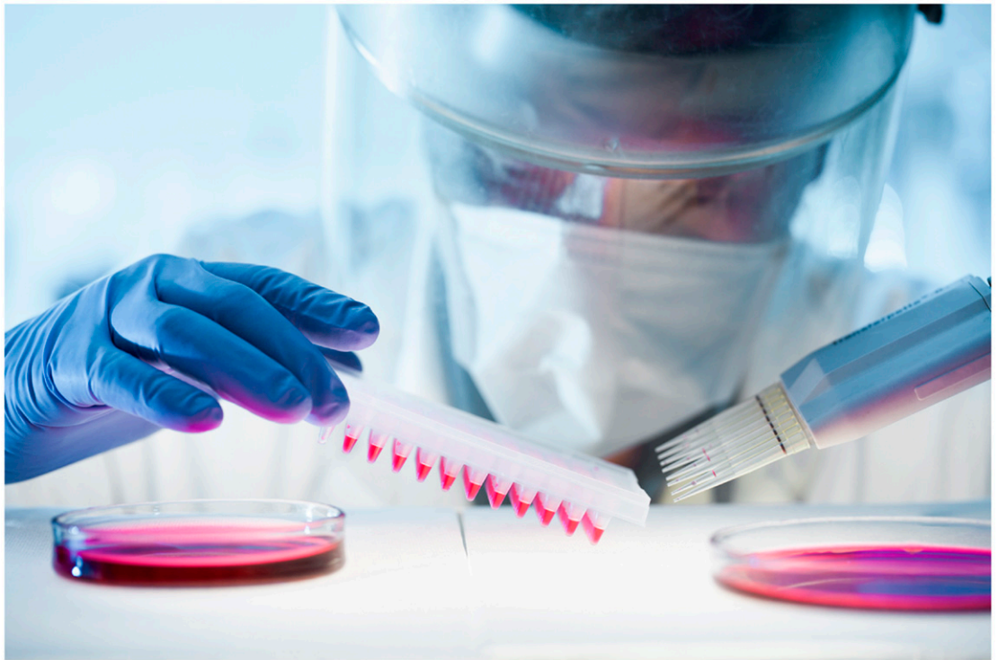
Armies of researchers around the world have launched coronavirus disease 2019 (COVID-19) clinical trials and completed studies at record pace.

Last month, the team published a preprint describing 69 potential drugs—24 of them already approved by the US Food and Drug Administration (FDA) for other diseases—that could help treat coronavirus disease 2019 (COVID-19) patients. The team identified the drugs by studying how 26 of the virus's